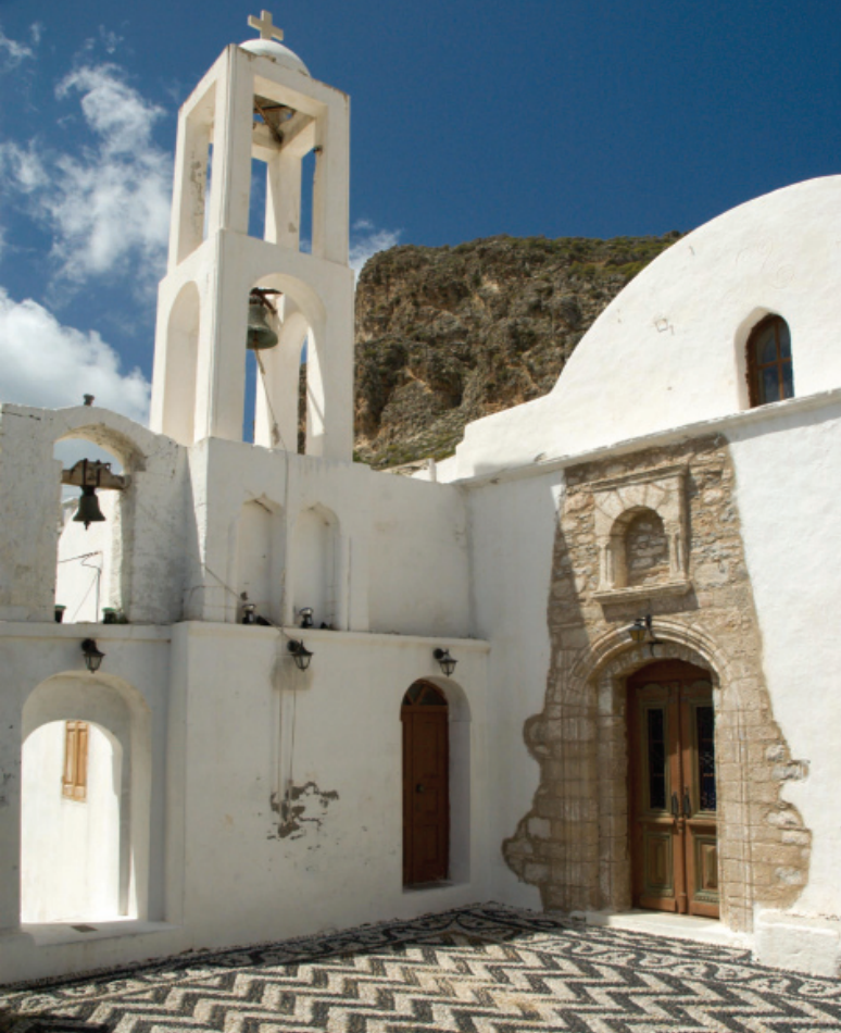
OPPOSITE (left) Chef Ali leads a cooking demonstration on board Naviga 2 ; (right) fresh seafood is a daily staple ABOVE The church square in the village of Megalo Horio on Tilos Island PREVIOUS PAGE The 85-foot ketch Naviga 2 is the perfect size for dropping anchor in small harbours and hidden coves