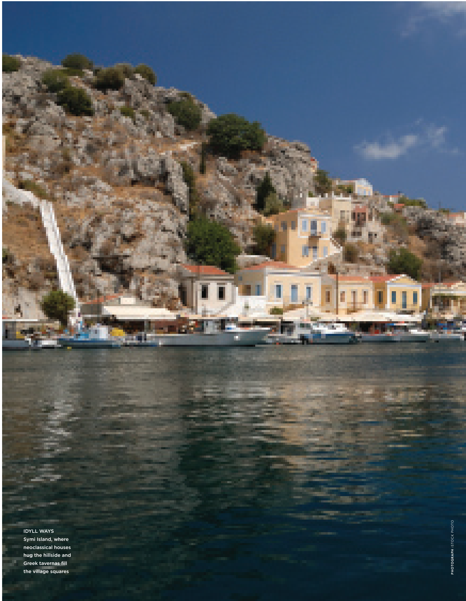
IDYLL WAYS Symi Island, where neoclassical houses hug the hillside and Greek tavernas fill the village squares